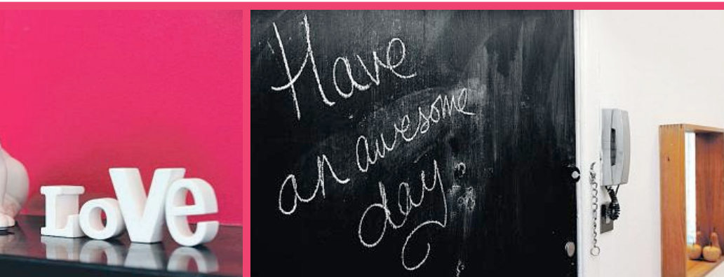
Clockwise from main: the master bedroom; the bedroom's fireplace sticker; the kitchen table; Zoe and Neil in the kitchen; white accessories on the mantelpiece; the front door has been painted with blackboard paint; multi-coloured tiles brighten the bathroom